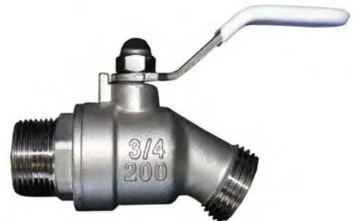
3/4" Male GHT Valve