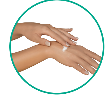
Apply blending cream to hands & feet including nails