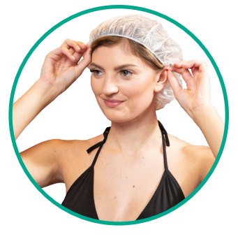
Put on hair cap - leave ears & hairline exposed