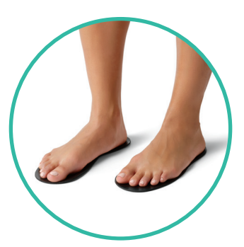
Use sticky feet/footies provided by salon to keep bottom of feet clean

NOTE: the FDA recommends wearing protective eyewear, nose filters, ear plugs, lip balm, and undergarments. Ask the salon staff for details.